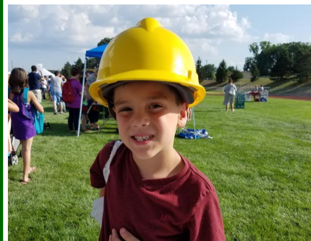
GTD gave away school supplies to nearly five hundred students who stopped in to see us. It was wonderful to witness the community come together for such a great event!