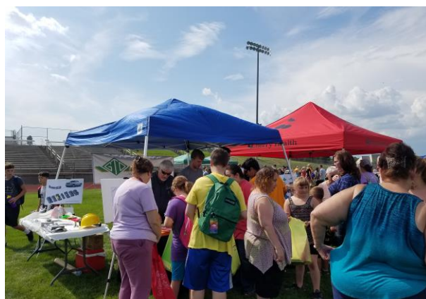
Restaurants provided a "Taste of Greenville" sampling. Exciting vehicles from fire engine to farm tractors offered a Touch-A-Truck demonstration.