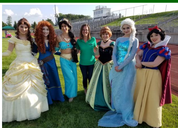
Even some princesses came to party. Games, activities, food & special give-a-ways were available free of charge for all attendees.