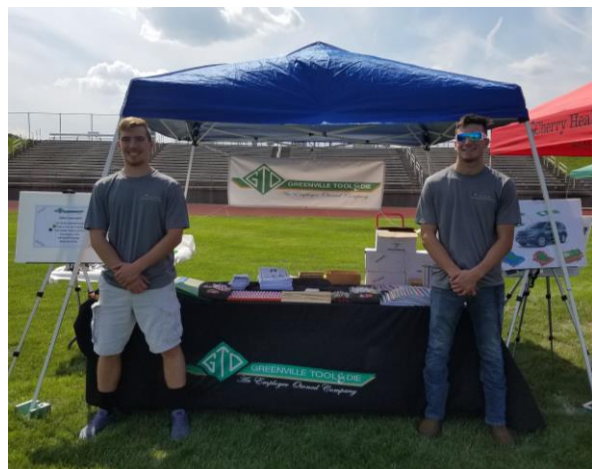
Vendors included local organizations, clubs, businesses, civic and non-profit groups, and GPS programs.