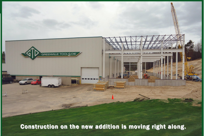
Construction on the new addition is moving right along.

Many thanks to our donors. Our next Blood Drive is Tuesday, July 8 from 12:00 noon to 6:00pm.